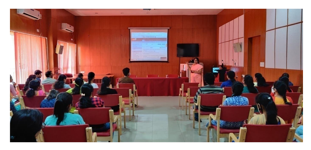
4) Library Orientation programme conducted for fresher's PG students for the year 2021-22